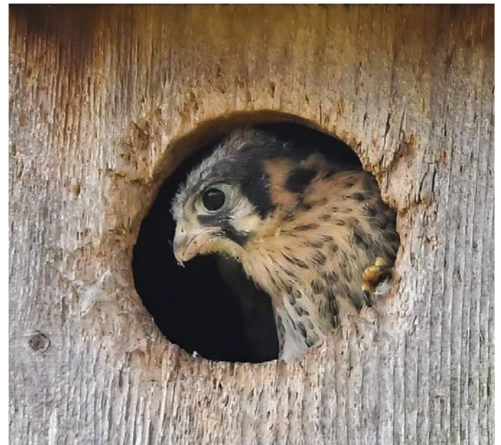
Nearly time to leave.