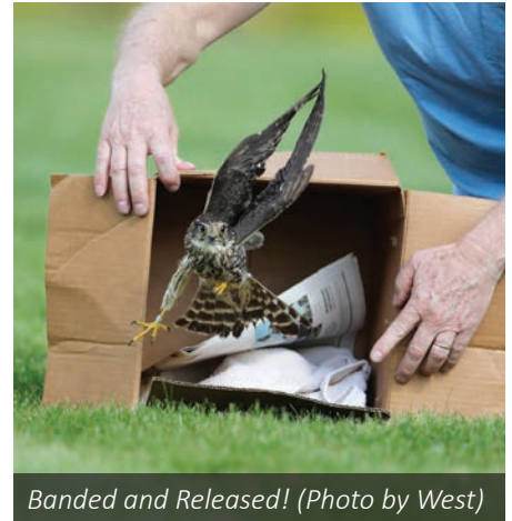
Banded and Released!

Merlins are small, fierce falcons that migrate throughout Ohio. Their breeding range is in the northern US and Canada, and their wintering range can extend as far south as Ecuador. They eat mostly birds, using high speed attacks to surprise their prey. Merlin populations have largely recovered from the declines seen in the mid-twentieth century, thanks to the ban on DDT and similar pesticides.