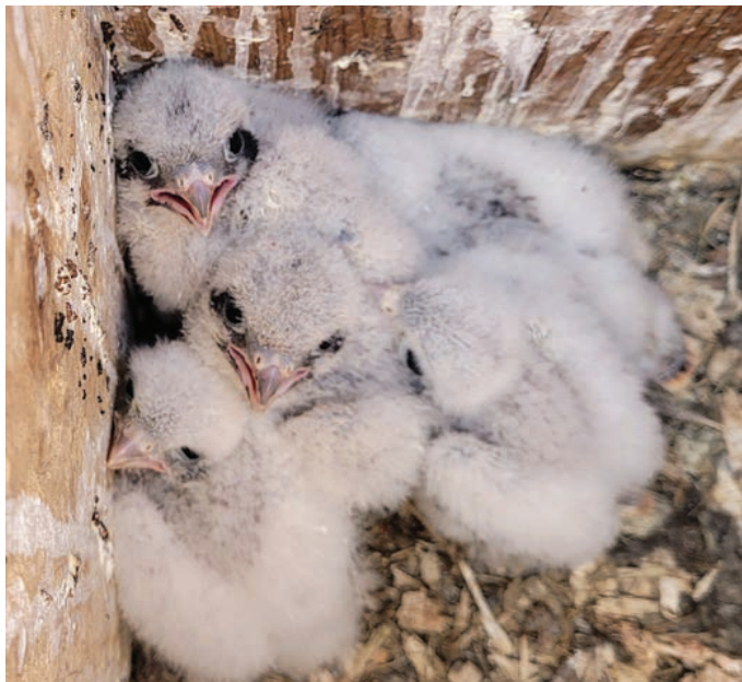
Snuggle time!

Please let us know if you are interested and would like more information on this project. 513 825-3325